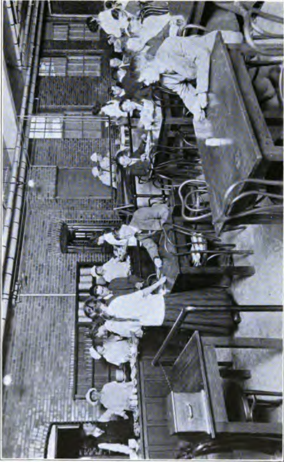
Household arts students at West Technical High School prepare and serve noon lunch